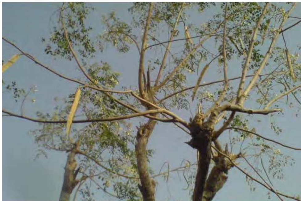
Fig. 2.1. Moringa oleifera tree

The Moringa tree grows mainly in semi-arid tropical and subtropical areas, but grows best in dry sandy soil; it tolerates poor soil, including coastal areas. It is a fast-growing, drought-resistant tree that is native to the southern foothills of the Himalayas, and possibly Africa and the Middle East. The tree has its origin from the Southern Indian State of Tamilnadu. Today, it is widely cultivated in Africa, Central and South America, Sri Lanka, India, Mexico, Malaysia and the Philippines. It grows up to 4m in height and develops to flowering and fruiting within one year of its cultivation. Moringa oleifera is considered as one of the world's most useful trees, this is because almost every part of the tree can be used for food, or has some other beneficial property. Hence it is commonly called the 'Wonder Tree'. In the tropics, it is used as foliage for livestock. The immature green pods, called "drumsticks" are probably the most valued and widely used part of the tree. They are commonly consumed in India, and are generally prepared in a similar fashion to green beans and have a slight asparagus taste (Rajangam et al , 2000).