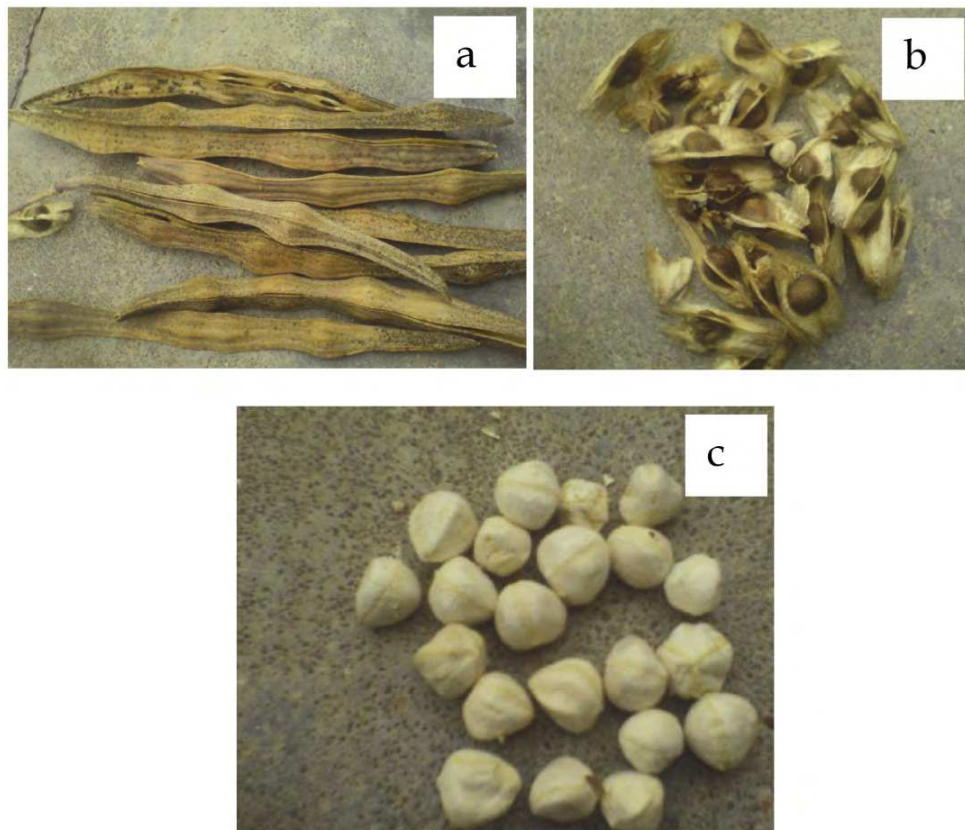
Fig. 2.2. Moringa oleifera (a) Dried pods (b) Seed kernel with husks (c) seed kernel without husk

The refined oil is clear, odourless and resists rancidity like any other botanical oil. The seed cake remaining after the oil extraction can be used as fertilizer or as flocculants to treat turbid water. The leaves are highly nutritious, being a significant source of beta-carotene, Vitamin C, protein, iron and potassium; it is consumed mostly among the Hausas in Northern Nigeria. In addition to being used fresh as a substitute for spinach, the leaves are commonly dried and processed into powder and used in soups and sauces.